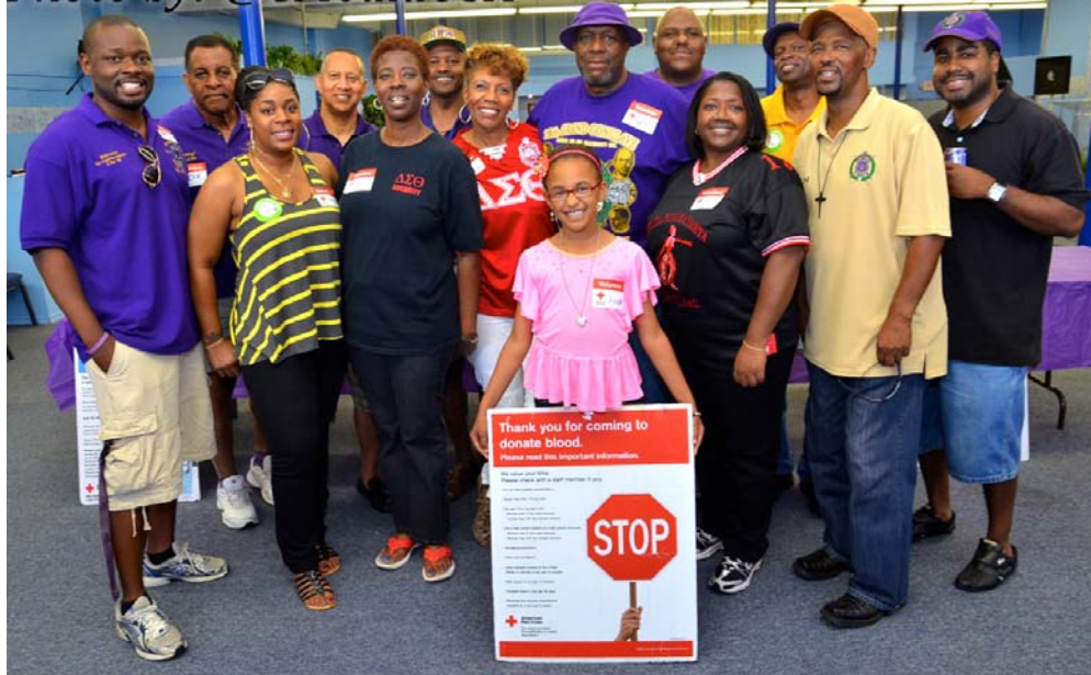
Tau Lambda Lambda Brothers and participants at the Blood Drive

Lexington Park, MD. June 15, 2013 Tau Lambda Lambda Chapter (TLL) of the Omega Psi Phi Fraternity, Inc. hosted its Charles R. Drew Blood Drive at the 10 th Annual St. Mary's County Juneteenth African American Heritage Celebration on June 15 th in Lexington Park, MD.