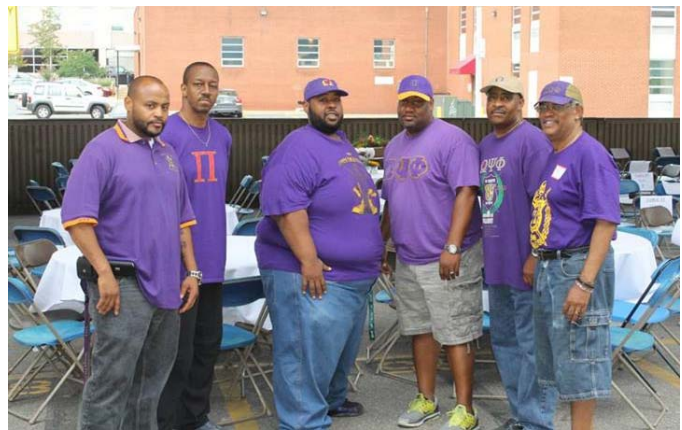
Pi Omega Brothers participating in the Fish Fry and Shoe Drive Event