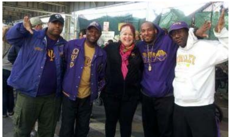
Alpha Upsilon Brothers participating in the MS Walk

New York, New York. April 28, 2013- The Men of Alpha Upsilon made their way to the South Street Seaport as the sun was peeking through the clouds seeking to warm the walkers participating in the annual Multiple Sclerosis walk, they among thousands with sneakers laced pounded the Lower Manhattan streets in support and with the goal of raising money for this amazing and worthy event. The money raised for this special event is primarily used for continuous research and to support life changing programs. The Men of Alpha Upsilon have lent their dollars and time to this occasion for eight consecutive years, each year walking to make a difference. Eight years later, it is apparent; the Men of Alpha Upsilon are committed to the cause and the goal of one day seeing their efforts and others pay dividends in the race for the cure of Multiple Sclerosis. Until then, they will continue to migrate to the streets of Lower Manhattan to join forces for this annual and very much deserving event.