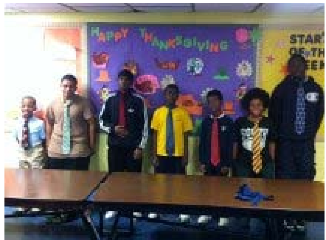
Youth participants in Omicron Chi Youth Initiative

Omicron Chi Brothers led over 20 workshops/discussions during the year. Workshop/forum discussion topics included: Personal Branding (Me, Inc.), The Law and You, "How to commu-