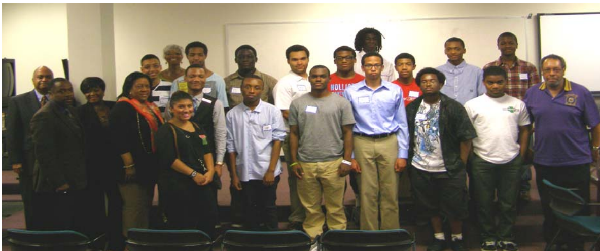
Omicron Iota's Young Achievers