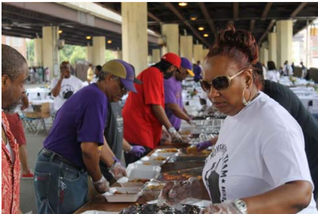
Pi Omega Brothers and volunteers prepare Fish dinners for Homeless

In addition, the Brothers of Pi Omega Chapter helped serve hot lunches and helped maintain order where clothes were given out. Several brothers brought their children to participate in the community service project.