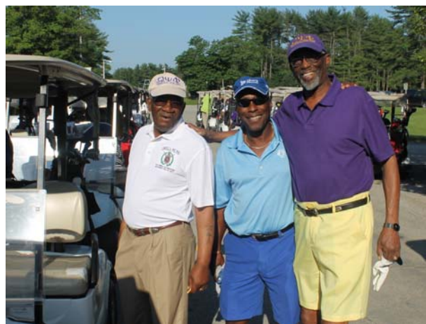
Pi Omega Brothers at BCDSS Golf Tournament

Baltimore, MD August 9, 2013. The Brothers from Pi Omega Chapter participated in The Baltimore City Department of Social Services (BCDSS) Annual Golf Tournament, on August 9, 2013 to benefit Baltimore City's children in Foster Care. The tournament was held at the Forest Park Golf Course & Clubhouse, 2900 Hillsdale Rd, Baltimore, MD 21207. The format was Captain's Choice, 18 holes. All teams began at 8:00 a.m. The teams consisted of three players with fourth player being a Baltimore City Youth-in-Care for the first nine holes. In Maryland, there are approximately 4,141 youth in foster care over the age of 14. The Baltimore City Department of Social Services has aggressively implemented an initiative, "Ready by 21," to involve older youth in every decision that affects them. A major vehicle for teen input is the Youth Advisory Board (YAB). This group empowers youth to have a positive effect in their communities by helping them to develop skills necessary for independent living and leadership development. Funds raised during this event will benefit the Youth Advisory Board projects.