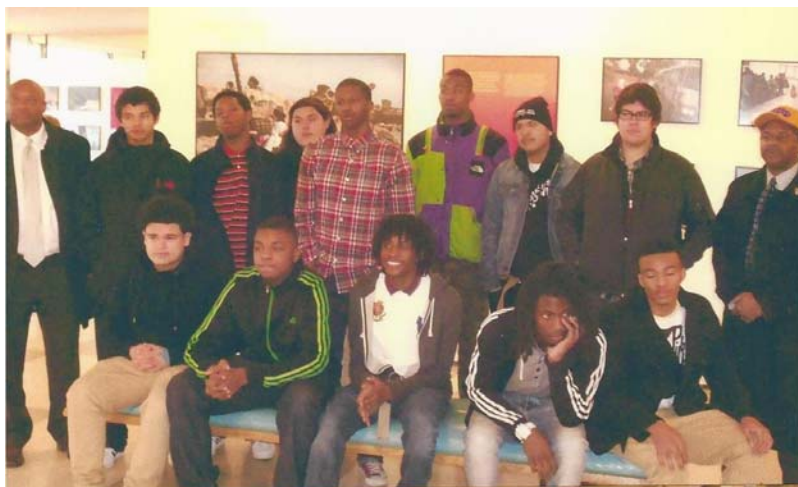
Mu Rho Brothers and participants in the Mentorship Program