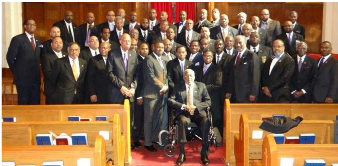
Alpha Upsilon Brothers in attendance at the Memorial Service