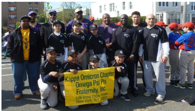
Kappa Omicron Brothers with Little League Team at Parade in April.

By mid-May, the Kappa Omicron's Team was in third place with a record of 7-7 and in June KO's team advanced to the second round of the playoffs with a final record of 10 – 8. The games are played in 6 innings. The players learned fielding plays, throwing ahead of the runners, hitting techniques and other skills from the Coaches. In the majority of the games the team averaged four hits per game. We are very proud of the team and of our involvement with this Little League sponsorship.