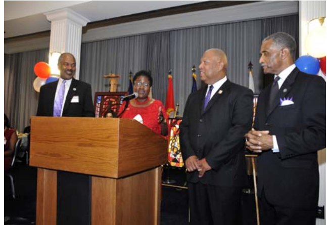
Gamma Pi Brothers honor Deltas at Military Service Event