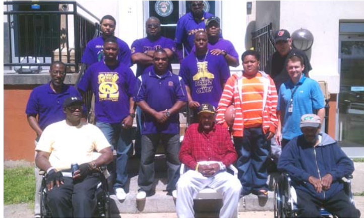
Iota Nu Brothers with Disabled Veterans at Perrypoint Veterans Administration Medical Center

The Brothers of Iota Nu visited the Veterans of Perry Point VA Medical Center to provide an atmosphere of appreciation and goodwill among the Veterans residing in the medical center. We provided food (grilled hamburgers, hotdogs, chicken, etc.) and fun to uplift the Veterans' spirits. Brothers also spent one-on-one time with individual Veterans learning stories of their services and sharing some stories of their own. Because many of the Veterans were not able to join in the outdoor festivities Iota Nu members