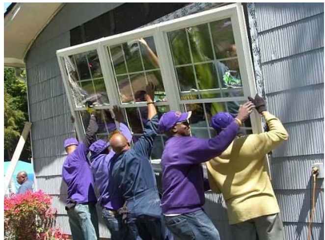
Mu Rho Brothers replacing a window. Working Hard for Omega

They also provided much needed assistance in mulching the property, planting bushes as well as installing a brick patio. Assisting in this endeavor were members of Sigma Gamma Rho Sorority Inc, Phi Beta Sigma Fraternity Inc., as well as the Rotary Club of Annapolis. When organizations can come together for a common goal is when good works can be accomplished.