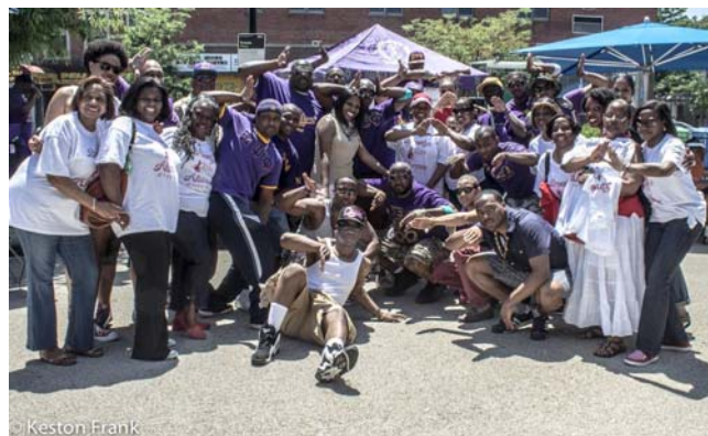
Alpha Upsilon Brothers with Deltas participating in the Blood Drive

ings and educate people on the importance of eating healthy and staying hydrated. This event was well attended and continues to grow each year.