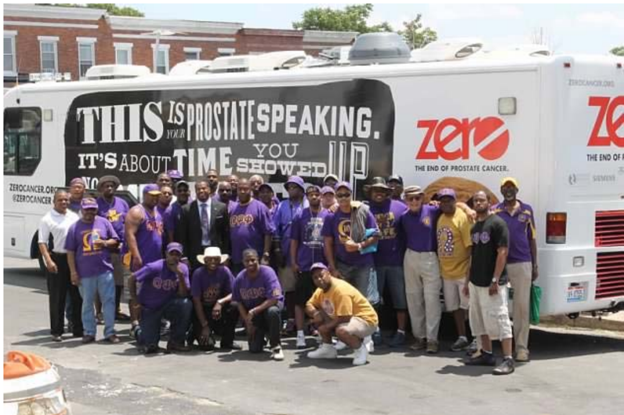
Pi Omega Brothers at the 4th annual Staying Alive Health and Wellness Fatherhood Initiative

In addition, the Brothers of Pi Omega Chapter manned the grills and gave the community a cook out and a parade was performed by the New Edition Marching Band.