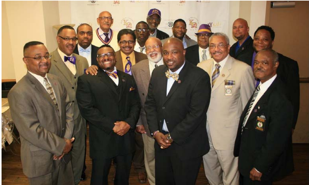
Kappa Omega Brothers in attendance at the Scholarship Banquet

Harrisburg, Pa. May 24, 2013. The Omega Psi Phi Fraternity, Inc., Kappa Omega Chapter of Harrisburg, Pa. continues its aggressive approach to incorporating Omega's cardinal principles into activities that uplift the community it serves. The preceding months saw Kappa Omega Chapter focused its attention on Scholarship.