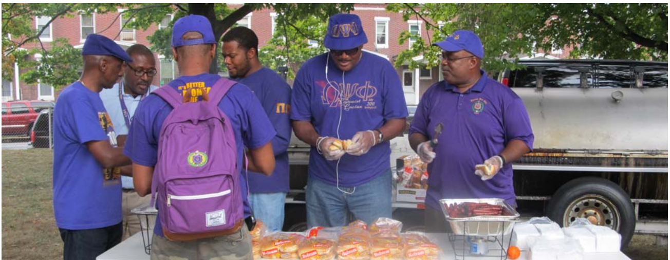
Pi Omega Brothers prepare food for cookout during Easterwood Basketball Court Dedication Ceremony