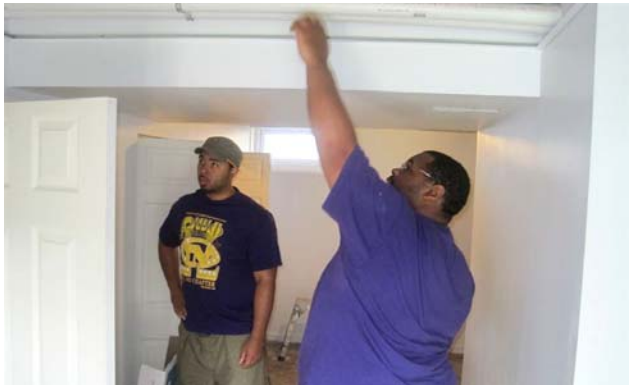
Iota Nu Brothers working on homes in Harford County, MD.

The mission of is that every man, woman and child should have a safe and affordable home to live in. builds and repairs homes all over the world using volunteer labor and donations. These ideals align with the mission of the brothers of Iota Nu chapter of Omega Psi Phi Fraternity, Incorporated and they will continue to participate in this program to aid families in their quest for home-ownership