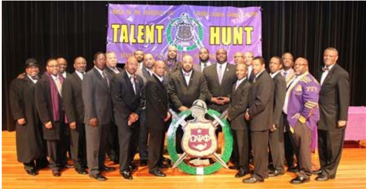
Lambda Gamma Gamma Brothers at Talent Hunt