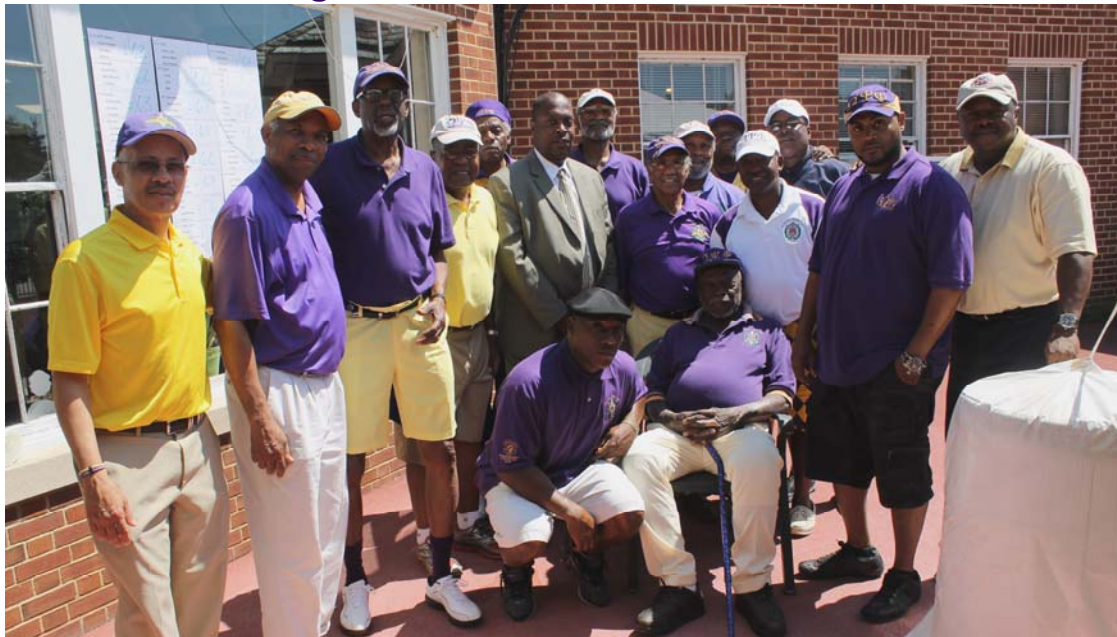
Pi Omega Brothers at the Pi Omega Foundation Golf Tournament

Baltimore County, MD June 2013. The Annual Pi Omega Golf Tournament, an event sponsored by the Pi Omega Foundation, was held at Pine Ridge Golf Course on June 21, 2013. Pi Omega Chapter has been a positive and influential organization in the Baltimore community providing scholarships, blood drives, mentoring, and other philanthropy related efforts. The event attracted 104 golfers, with approximately 40 Omega Brothers from Pi Omega, Gamma Pi, and Iota Nu. Prizes were awarded for Longest Drive, Male and Female, Closest to the Pin, Male and Female, Flight winners in Flights A, B and C, and a variety of door prizes.