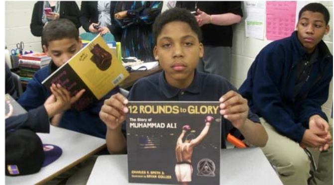
Students from Camp Curtin Elementary School in Harrisburg, PA. who participated in 500 Men Reading Week supported by Kappa Omega Chapter