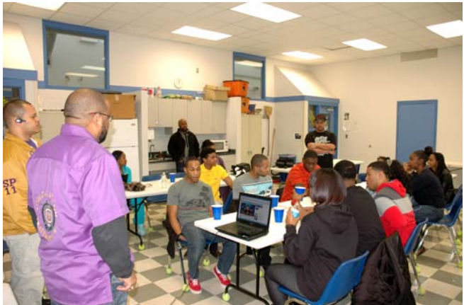
Iota Nu Brothers encourage youth for membership in the NAACP