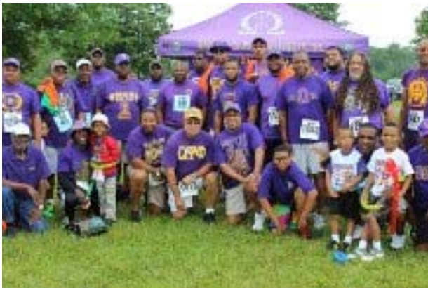
Delta Upsilon Participants at the Prostate Cancer event

Trenton, NJ. July 22, 2013. Over 75 Brothers, Family, and Friends of the Dynamic Delta Upsilon participated in the American Cancer Society's 11 th Annual "Run for Dad" Father's Day event to raise funds and awareness for Prostate Cancer research held at Mer-