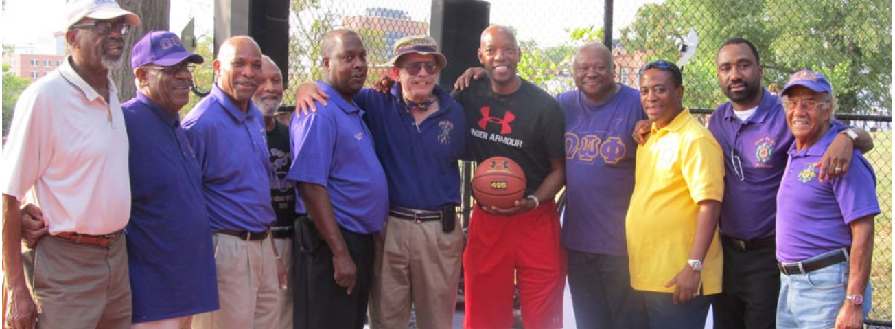
Pi Omega Brothers with NBA Great Sam Cassell