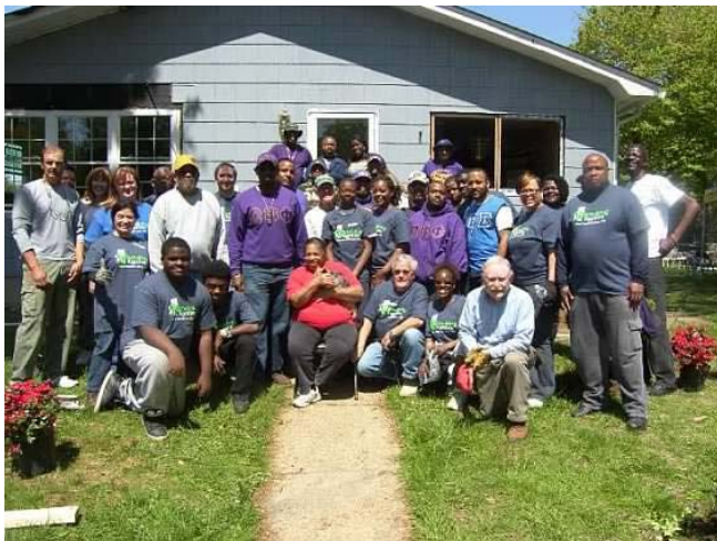
Mu Rho Brothers and other participants in the home remodel.

Annapolis, Maryland Saturday April 27, 2013: Approximately 20 members of Mu Rho Chapter partnered with Rebuilding Together to repair and improve the home of a deserving senior citizen of Annapolis. Rebuilding Together utilizes over 200,000 volunteers each year and completes nearly 10,000 projects on an annual basis. The projects are meant to improve and modify existing homes of low income residents who could not otherwise afford the repairs. The Brothers replaced windows and doors.