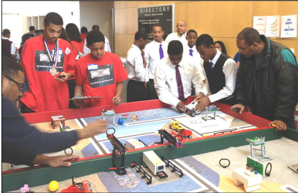
“Team Omega” programming their NXT device for the next challenge.

Bowie, Maryland – Saturday, February 11 th , 2012, Lambda Gamma Gamma Chapter (LGG), of the Omega Psi Phi Fraternity, Inc., home of the "Capital Region Ques", sponsored and supported “Team Omega” in the first annual Patriots/Omega Lego Robotics competition held at the Bowie State University Computer Science Building.