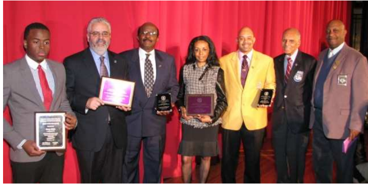
Beta Alpha Alpha Achievement Week Awardees