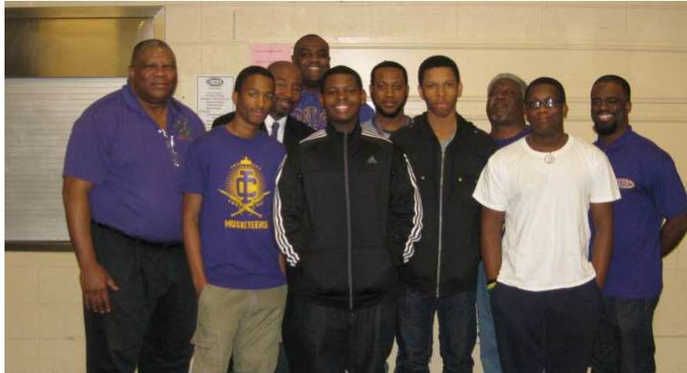
Chi Rho Brothers with Central Islip High Students

Central Islip, N.Y. January 19, 2012. Omega Psi Phi Fraternity, Inc., Chi Rho Chapter participated in a "Personal Development Workshop", at Central Islip High School, in Suffolk County N.Y. The workshop was geared toward assisting adolescent African American males, grades 9 through 12, with personal self management skills and general social skills. The students were given questionnaires to fill out concerning their day to day activities and social agendas. The students were also asked to list the talents they have acquired and how they have developed those talents. Through the exercises the students were able to give feedback on how they deal with decisions made at school and in their neighborhoods. The Chi Rho Brothers assisted the students with developing strategies for making healthy decisions and reducing stress. Also discussed were ways to build healthy relationships with peers