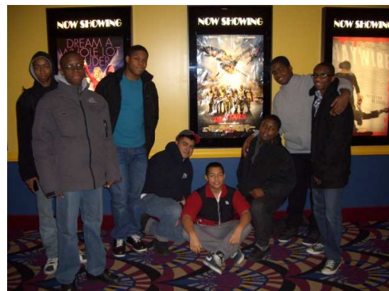
Kids attending Red Tails sponsored by Beta Alpha Alpha Chapter

Proceeds will benefit the organizations Fatherhood Initiative, a