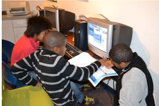
Nu Upsilon Kids in the STEM Program

In the STEM activity the students went on a virtual tour related to Global Hot Topics such as military technology; sports medicine and technology; feeding the hungry; curing disease and managing