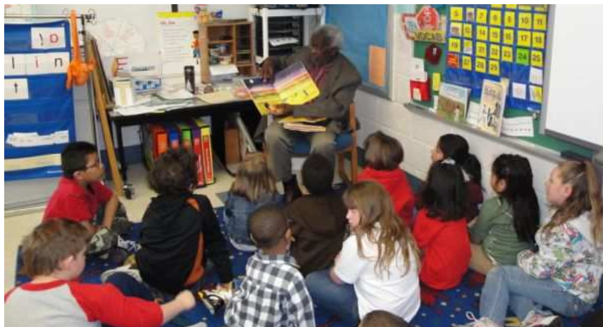
Nu Upsilon Brother reading to children at the Annual Read-a-Thon Program

Wilmington, DE. February 2012. – One of the signature Social Actions Programs of Nu Upsilon is its Annual Read-a-Thon, held in February of each year. And, February 2012 was no different.