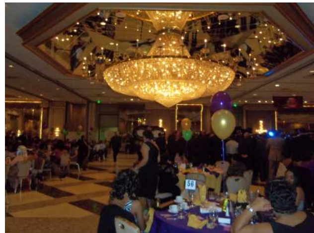
Mu Nu Mardi Gras