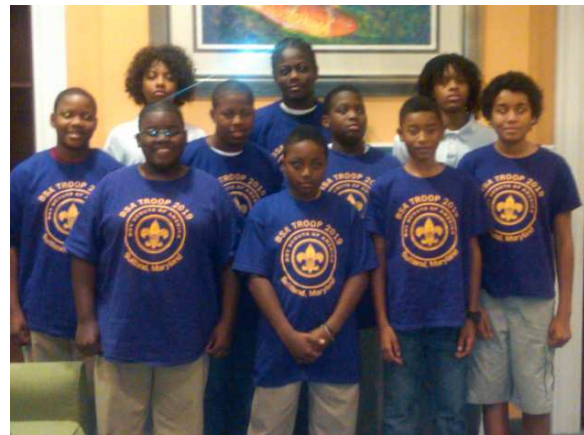
Boy Scout Troop #2019