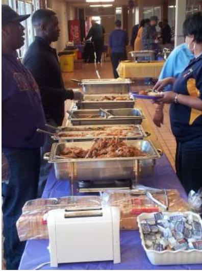
Nu Nu Brothers serving guest at the Brunch