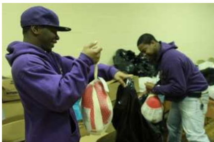
Upsilon Mu chapter brothers assist in the collection and distribution of holiday turkeys

Mu assisted Hempstead Village Mayor Wayne Hall in the donation, collection, and distribution of over 300 turkeys to members of the community. Among other holiday social action projects initiated by the undergrads of Upsilon Mu chapter that were held this holiday season in various Long Island communities were an annual "Kids Day" program in Freeport, Long Island along with a step show exhibition and annual tree-lighting event in Hempstead Village.