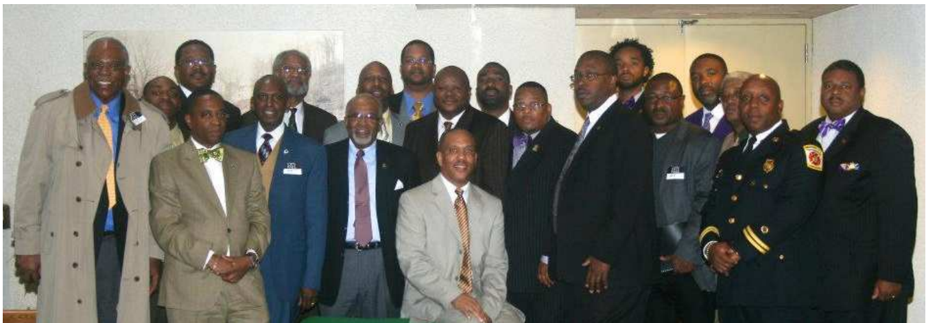
Pi Omega Brothers in attendance at the Baltimore City Board of Estimates Meeting