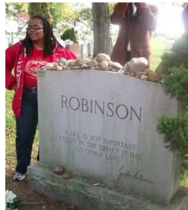
Delta Soror at the Jackie Robinson Gravesite