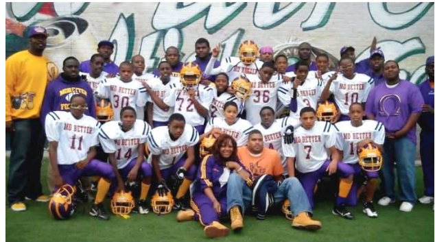
Epsilon Chapter Brothers with Mo Betta Jaguars Football Team