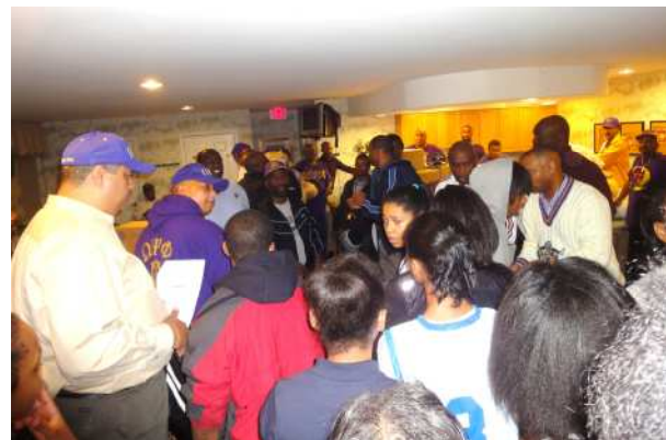
Gamma Pi Brothers and volunteers assembling Thanksgiving Baskets for distribution to needy families