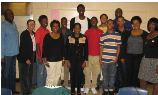
Chi Rho Mentoring Program participants at Central Islip High School

Chi Rho Chapter along with Delta Sigma Theta Sorority, Inc., Suffolk County Alumni Chapter, and the Suffolk County Links, Inc., assisted the students with developing character through strengths and personal skills. We ask the students a series of self assessment questions. For example the students were asked to write three things they liked about them selves. We also asked the students to share their lists of things they like about each other. These and other self assessment question