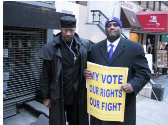
2nd District NAACP Protesters at the March for Freedom March to Dag Hammarskjold Plaza, NY.