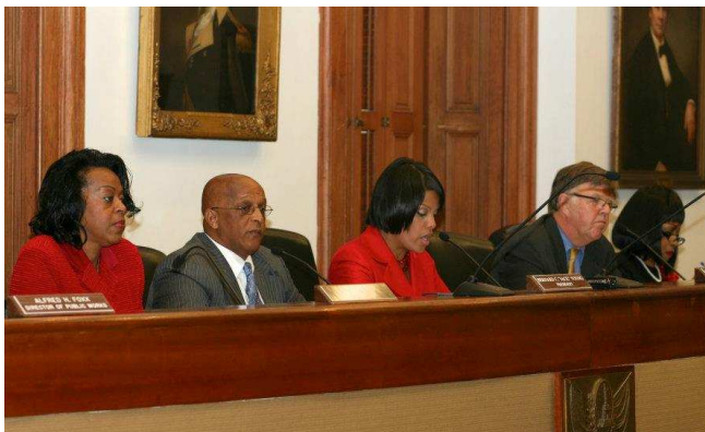
Baltimore City Board of Estimates

Omega Baltimore is a 501c (3) nonprofit organization formed to assist the Men of Omega Psi Phi Fraternity, Inc. Pi Omega Chapter in servicing the community.