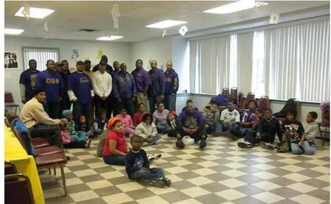
Gamma Pi's Que Kidz Daze Program