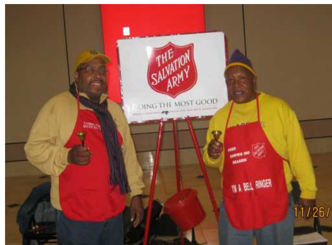
Sigma Beta Beta Brothers Volunteer with Salvation Army

Sigma Beta Beta Chapter is involved with the Salvation Army Red Kettle Project because this is a special community outreach program which assists with the needy in the community.