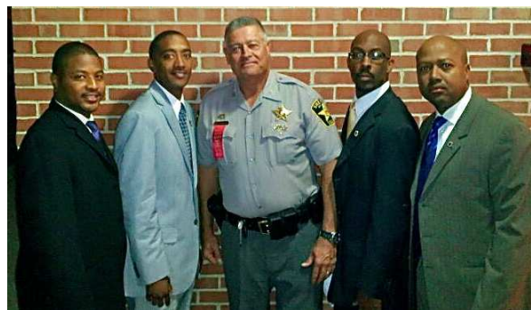
TLL Brother with Charles County Police Officer at Reception

TLL Chapter’s mission of uplifting humanity in the areas of scholarship and social action fit perfectly with the mission of the Crisis Intervention Center, which is to end family and sexual violence through avenues such as counsel-