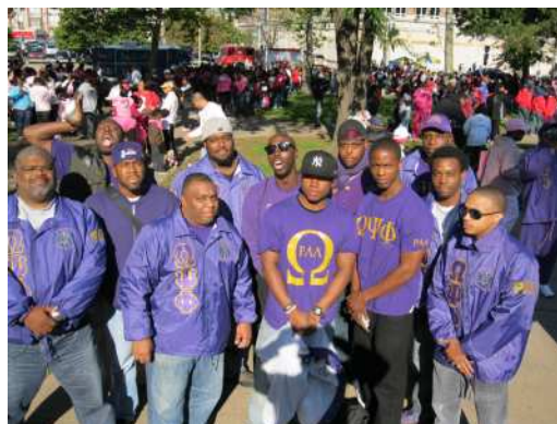
Rho Lambda Lambda Brothers participating at Breast Cancer Walk

Orange, NJ. October, 2011. Rho Lambda Lambda Chapter held a month long scholarship raffle ticket sale. For $3 friends and family of Omega had a chance to win a 22" flat screen TV. The drawing was done October 16, 2011 after the breast cancer walk. The winner was a lucky young lady. The chapter raised more then $2,000 for our Erwin Ponder scholarship fund. To help our youth cut some of the cost of college.