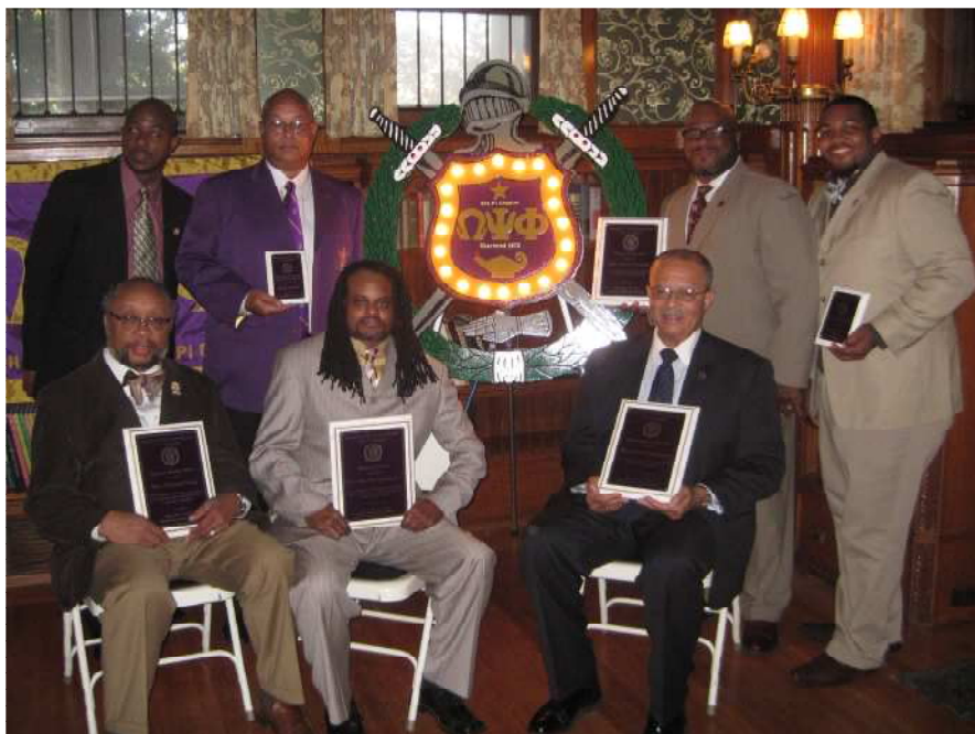
Eta Pi Achievement Award Recipients

East Orange, NJ. November 2011. On Saturday, November 12, 2011 the Mighty Mighty Eta Pi Chapter of the Omega Psi Phi Fraternity, Inc. held its 38th Annual Achievement week celebration at the African American United Fund building in East Orange, NJ. Each year this phenomenal program recognizes individuals that make valuable contribution in the community.