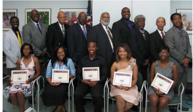
Chi Rho Scholarship Committee with Scholarship Recipients