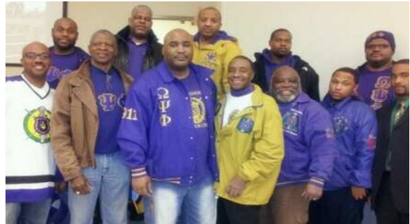
Tau Pi Brothers at the Christmas Give Away

Each year, with the help of many willing hearts, St. John's delivers Christmas gifts to needy families within the greater Columbia area consisting of turkeys, other food, and possibly small gifts for families with children. For now over a decade, Tau Pi Chapter has been very active in supporting the efforts of St. John's during the holiday season. Several Tau Pi members call St. John's their church home. This year the Brothers of Tau Pi also received assistance in doing this effort with Chi Delta, their undergraduate chapter partner, along with Gamma Epsilon and Beta Kappa, two other undergraduate chapters. The fellowship hall at St. John's serves as 'mission control' for the operation. Once families have been identified, gift bags