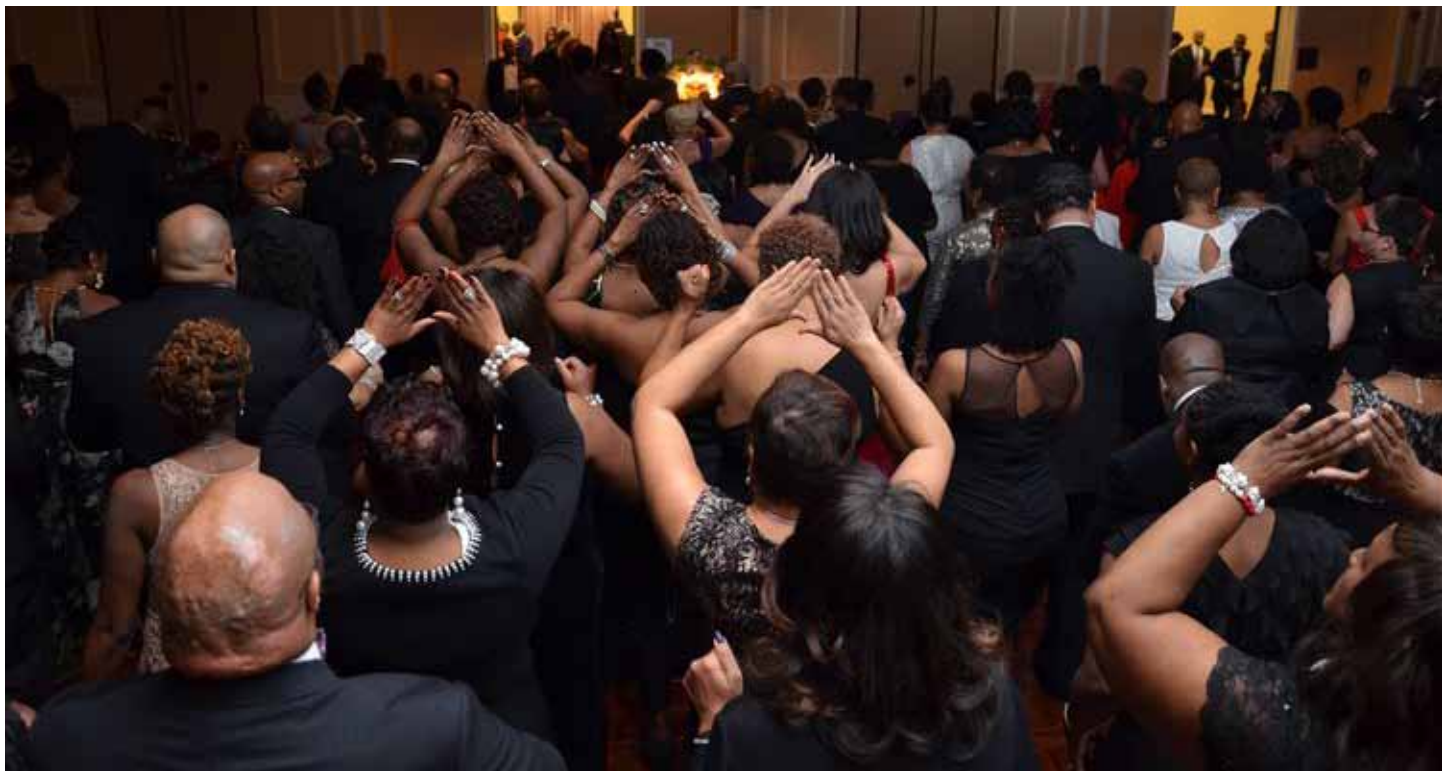
Tau Pi Holiday With Omega Patrons dancing the night away