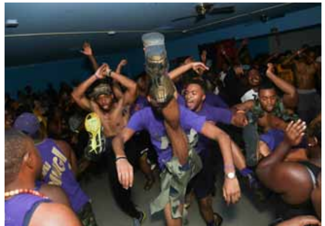
Pi Brothers Stepping at Fundraising Party