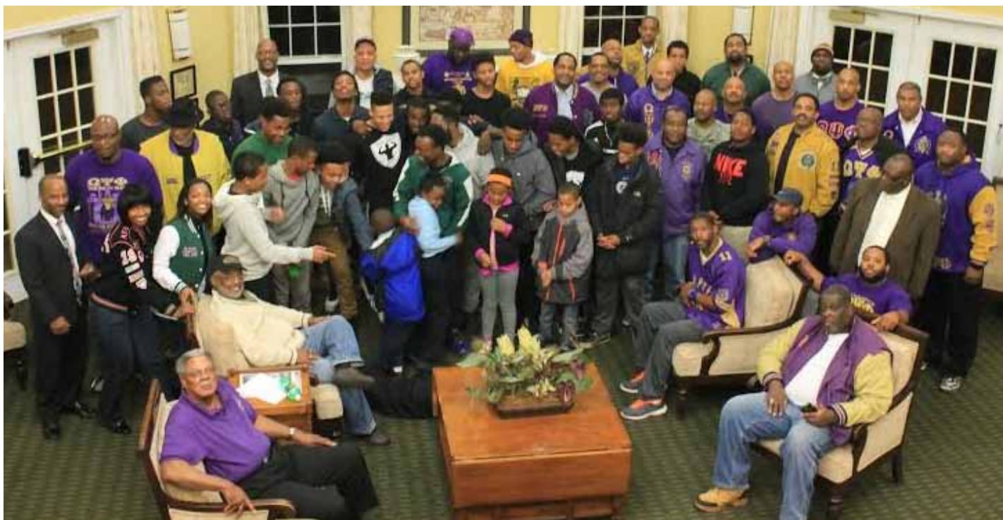
Lambda Gamma Gamma & Gamma Pi participants at the Thanksgiving Basket Giveaway

Suitland, MD. November 25, 2014. Lambda Gamma Gamma Chapter (“LGG”) and Gamma Pi chapter joined once again to provide turkeys with all the trimmings to seniors at the Windsor Crossing Apartment Community. The chapters provided turkey baskets to 100 seniors so that they could fully enjoy the Thanksgiving holiday. In terms of participation, over 20 Brothers from LGG and Gamma Pi, 18 boys