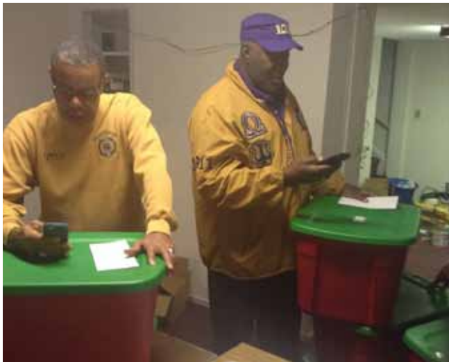
Nu Nu Brothers preparing Thanksgiving Baskets

Burlington, NJ November 24, 2014. The Brothers of Nu Nu chapter prepared Thanksgiving baskets for the needy at the Omega Community Development Center. The Brothers of Nu Nu had given generously to provide a complete thanksgiving meal including a whole turkey to 18 needy families in Burlington County. There were jumps for joys, praises to God and several tears of joy shed by more than a few of the Black, Caucasian and Latino recipients on our list. Each family was delivered a basket that only required cooking and seasoning. This is an annual effort by Nu Nu to assist the less fortunate at Thanksgiving.