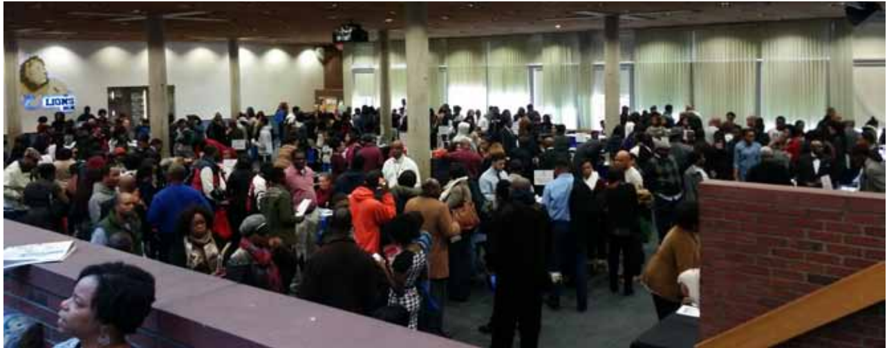
Participants at the HBCU College Fair

Trenton, NJ. November 22, 2014. Over 1000 students and parents visited with over 45 HBCU representatives at Annual HBCU College fair recently held in Trenton, NJ. Over a million dollars in scholarship money was awarded to students on the spot and over 100 college application