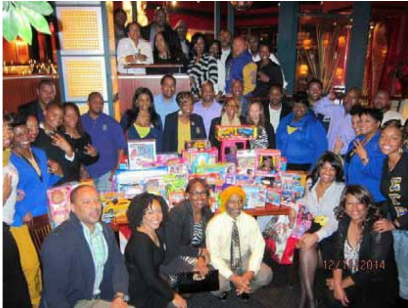
Lambda Gamma Gamma Brothers and Sigma Gamma Rho Sisters at Toy Drive

Largo, MD. December 11, 2014. Brothers from Lambda Gamma Gamma chapter ("LGG") and the ladies from the Lambda Delta Sigma Chapter of Sigma Gamma Rho, Inc. successfully completed their annual Toy Drive at Jasper's Restaurant in Largo, MD. The joint venture was used to solicit donations of unwrapped gifts from membership of both chapters. Each attendee joined to fellowship at Jasper's for a few hours and, more importantly, gather toys for Georgetown East Elementary School in Annapolis, MD.