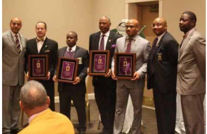
Tau Pi Founders Stand Ins