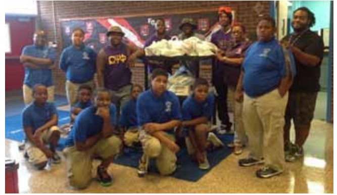
Delta Beta Brothers with Mentees at the Back to School Drive

Baltimore, MD. The Brothers of the Delta Beta Chapter of the Omega Psi Phi Fraternity Inc. hosted their first annual “Back to School Drive” The Brothers of Delta Beta raised funds and purchased school supplies to donate. There was over $300 raised, this money was then used to purchase back to school items that were donated to the Rosemont Elementary- Middle School here in Baltimore, Maryland.