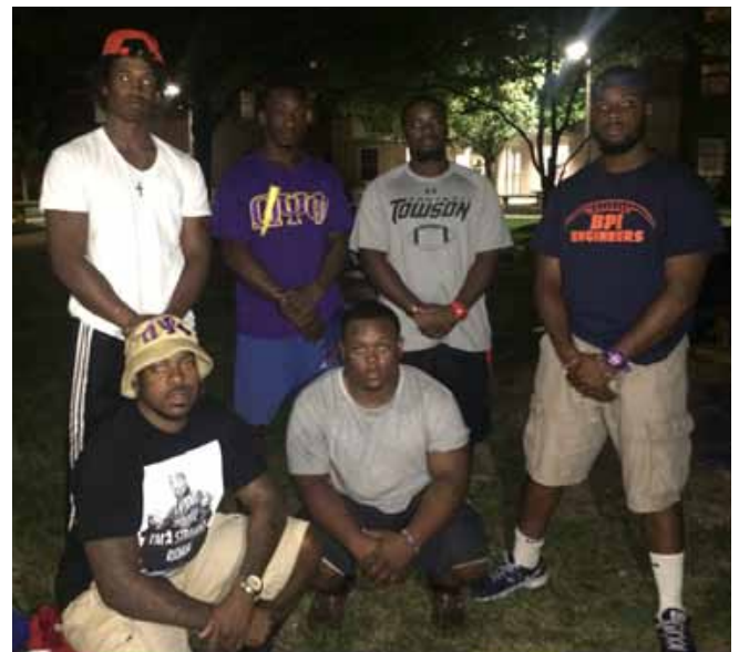
Delta Beta Brothers at York College