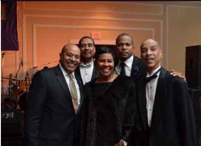
Tau Pi Brothers with Fur Raffle Winner and Mano Swartz Representative