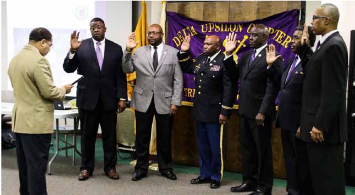
Delta Upsilon Officer receive the Oath of Office at the Installation Ceremony