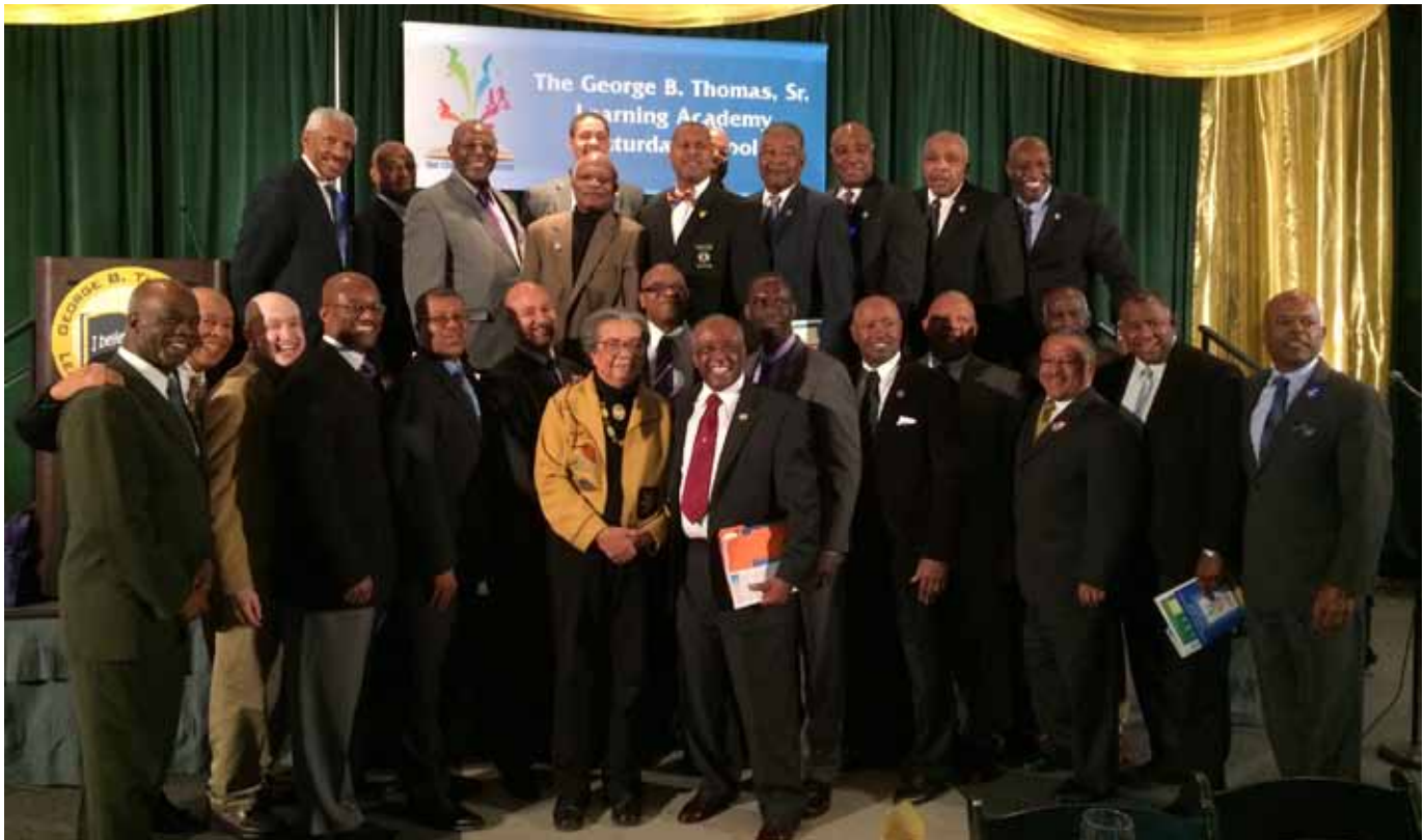
Mu Nu Brothers with Keynote Speaker Mariam Wright Edelman (center)