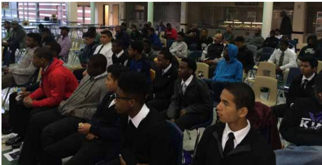
Youth participants at Lambda Gamma Gamma Youth Leadership Conference

Bowie, MD. October 11, 2014. Lambda Gamma Gamma Chapter (“LGG”), in conjunction with the Uplift Foundation, successfully completed their annual Youth Leadership Conference (“YLC”). This year’s conference, held at Charles Herbert Flowers High School, featured interactive workshops for high school boys and their fathers. Topics included leadership skills, networking, communication, net-