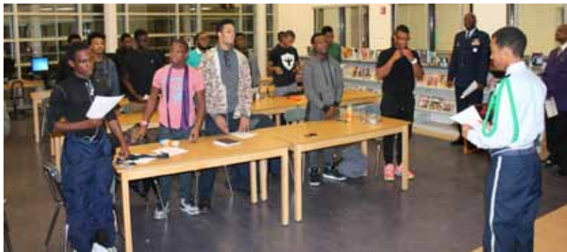
Lambda Gamma Gamma Assault on Illiteracy Program in action