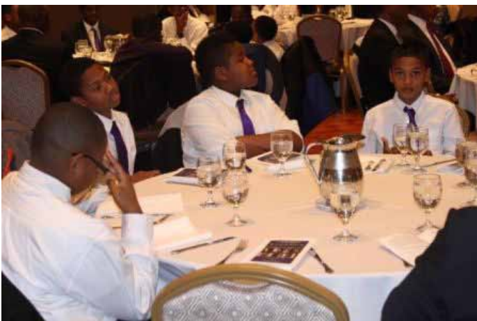
Tau Pi Mentees in attendance at Achievement Week Banquet