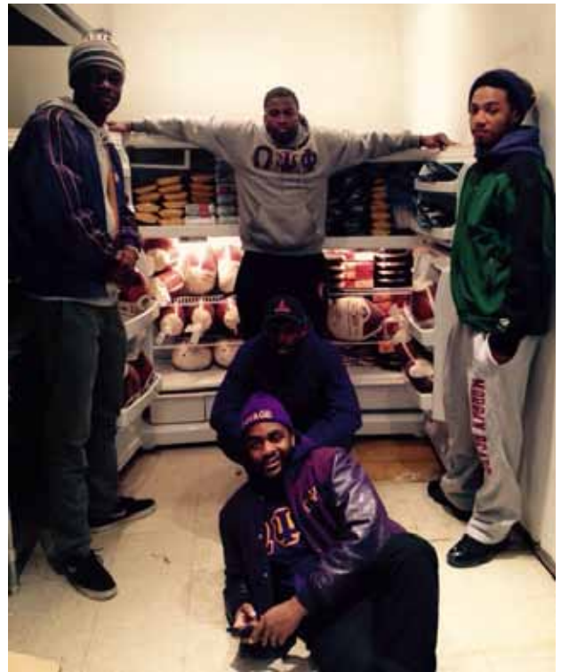
Pi Chapter Brothers finish packing refrigerators and freezers full of food for the less fortunate during the holiday season.