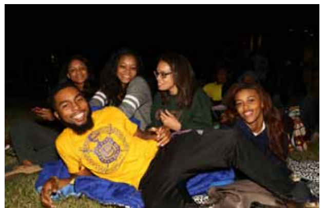
Omega Cinema Participants