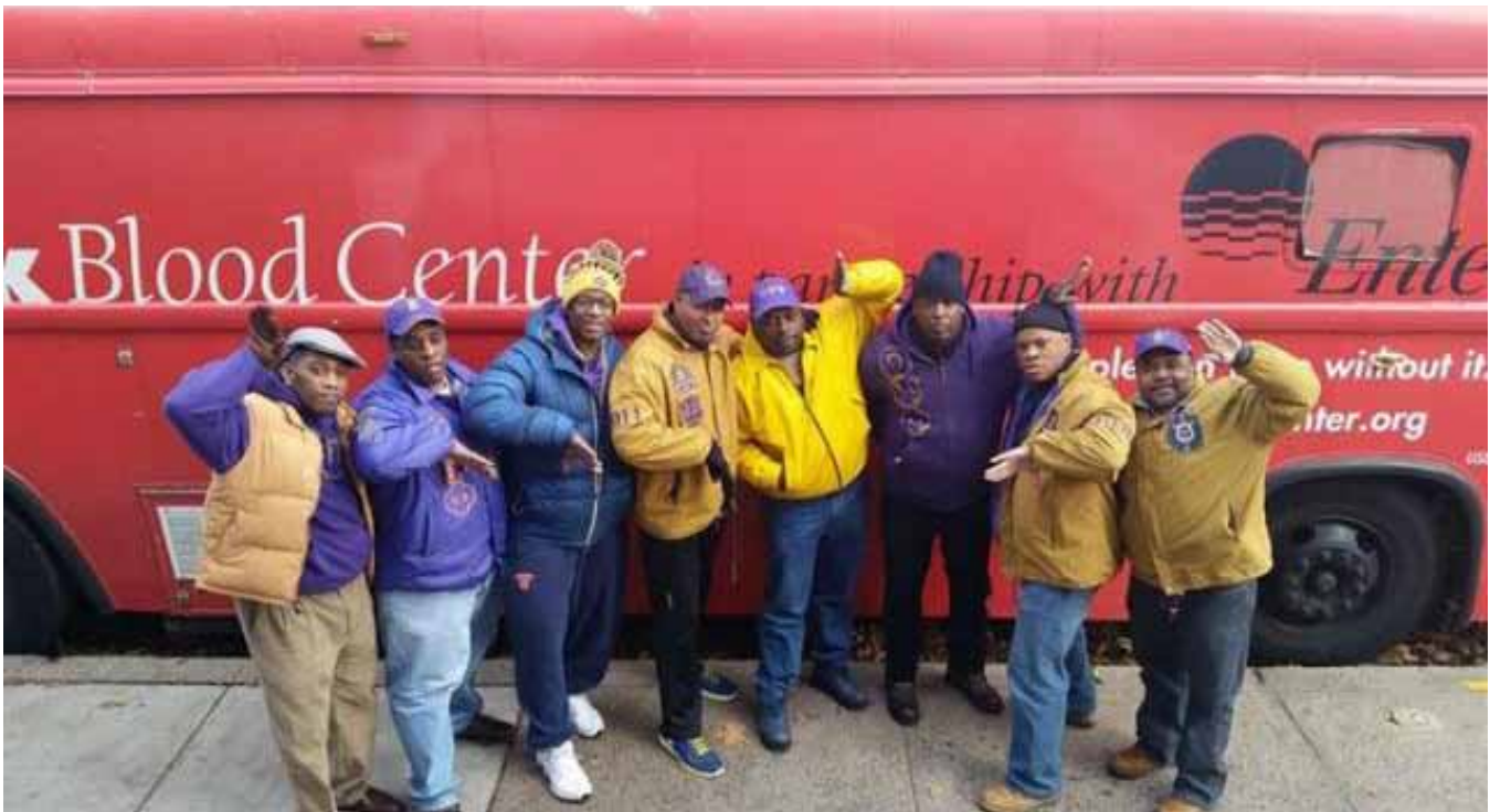
Xi Lambda lambda Brothers at the Charles Drew Blood Drive

Nyack, New York. November 28, 2014. The Men of the Xi Lambda Lambda Chapter of Omega Psi Phi Inc. held their annual blood drive in honor of Bro. Dr. Charles R. Drew. This year’s drive was held in Nyack, New York (in front of the Nyack Center). Due to the holiday weekend securing a brick and mortar structure to hold the blood drive was difficult thus the New York Blood Center provided a Blood Center mobile unit. The mobile unit came with a staff of nearly ten (10) health care professionals. This effort was a success as we received 16 whole pints blood from the donors, in spite of the drive being held the day after Thanksgiving.