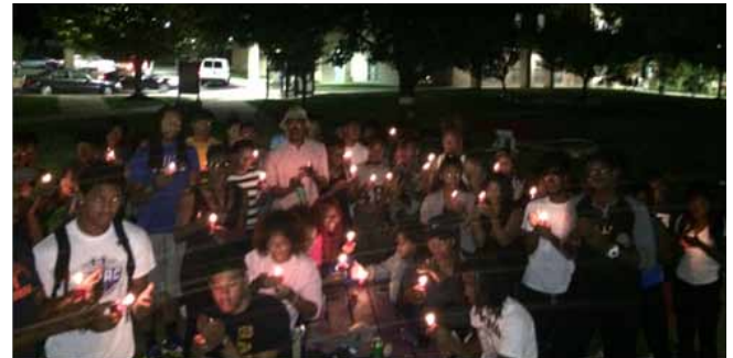
Delta Beta Brothers remembering 9/11 Event

Baltimore, MD. September 11, 2014. The brothers of the Delta Beta Chapter of the Omega Psi Phi Fraternity Incorporated hosted “Remembering 9/11” on September 11, 2014 on the campus of Coppin State University. This event was hosted and facilitated by the brothers of Delta Beta chapter. Members of the Coppin State Community came to the omega plot to fellowship and dwell together in remembrance of the lives lost on that tragic day in 2001. There were over 50 people in attendance. At the end of the event the brothers as well as participants lit candles and came together for a moment of silence and prayer. There was also opportunity allotted for participants to share their experiences and what they remembered from that day.