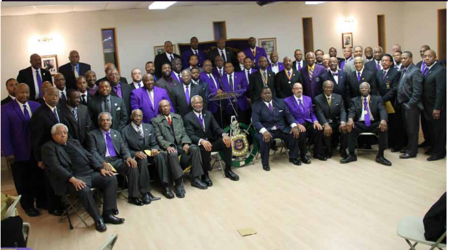
Omega Men in attendance at the Pi Omega Achievement Week Founders Day Observance