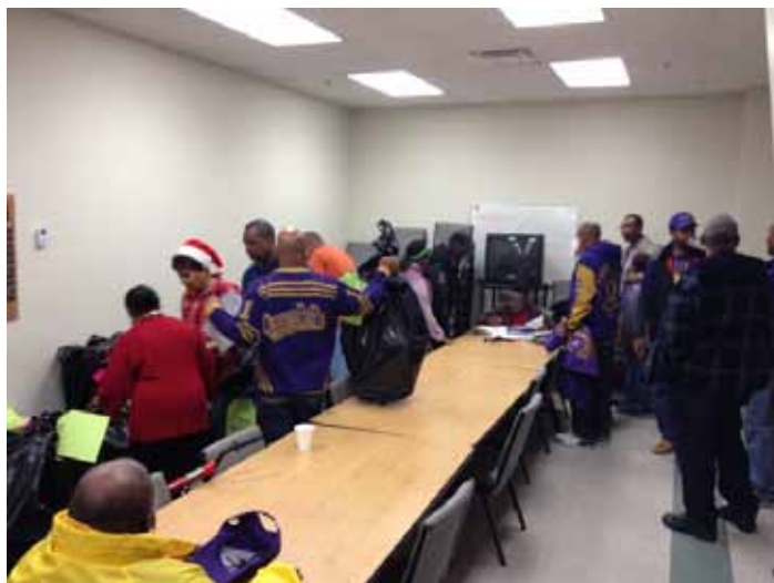
Tau Pi Brothers Volunteering at Christmas Giving Event

It was apparent that Brothers of the Omega Psi Phi Fraternity, Inc. had a strong presence at the event. Brothers representing various Undergraduate (Pi, Beta Kappa, Chi Delta) and Graduate (Tau Pi) chapters were there to provide assistance, remaining true to providing continuous social action by participating and coordinating activities that will uplift their communities. As another holiday season comes to pass, it's great to know that many