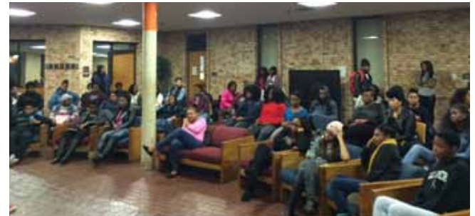
Delta Beta Brothers Social Media Forum