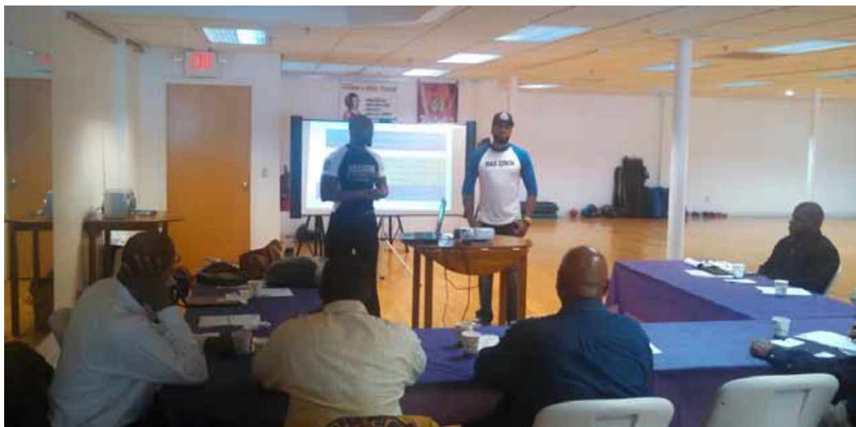
Omicron Chi Business and Roundtable Forum

Plainfield, NJ. Over the past year Omicron Chi Chapter has convened brothers from around the region to uplift and accelerate business and career development through workshops and seminars. Birthed out of chapter Reclamation and Retention efforts, the Omega Business and Career Development Roundtable serves as a platform for brothers to come together in friendship to share business and career strategies, highlight keys to success and provide skills-based learning opportunities to support brothers in their effort to move their business and career endeavors to the next level. The Roundtable sponsors a "Business Breakfast Meeting" on the 3rd Saturday of the month. The inaugural meeting was appropriately held at the Omega Diner in North Brunswick.