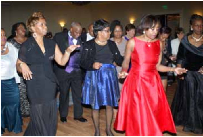
Mu Rho Brothers and guests danced the night away.