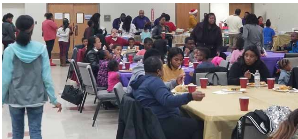
Tau Pi Christmas Dinner at St Johns Baptist Church

Columbia, MD. December 20, 2017. The Brothers of Tau Pi chapter in conjunction with Mu Beta Beta's Spring 2016 Line provided dinner and gifts to 20 families and 15 staff members of St John Baptist Church in Columbia, MD.