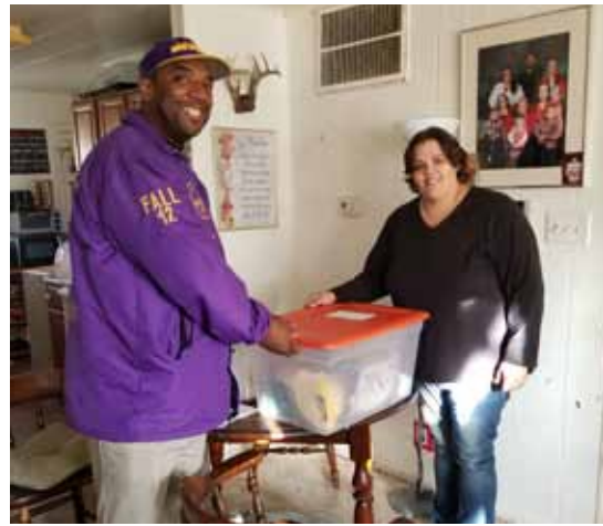
Nu Nu Brothers partner with BJ's and deliver Thanksgiving meals to needy families

Burlington, NJ. November 21, 2017. As Part of the Omega Psi Phi Community Outreach Initiative, Nu Nu Chapter held its Thanksgiving Basket delivery on November 21, 2017. The Brothers of Nu Nu Chapter, in partnership with BJ's Wholesale of Burlington, NJ delivered some holiday cheer to needy families of Burlington, NJ. The Brothers of Nu Nu had given generously to provide a complete thanksgiving meal including