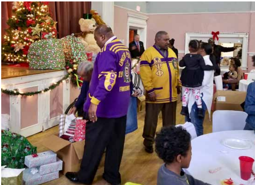
Omicron Mu Nu Brothers giving Christmas gifts to kids in the community

in Chester County Pennsylvania with approximately 5,000 households, and 3,000 families. According to 2010 census data 50% of the households and families are African American. With 18% of families, and 22% of Coatesville population living below the poverty line The Brothers of Omicron Mu Nu recognize Coatesville as fertile ground for service to offer hope, demonstrate the love of God, and an opportunity to shine the light of Omega.