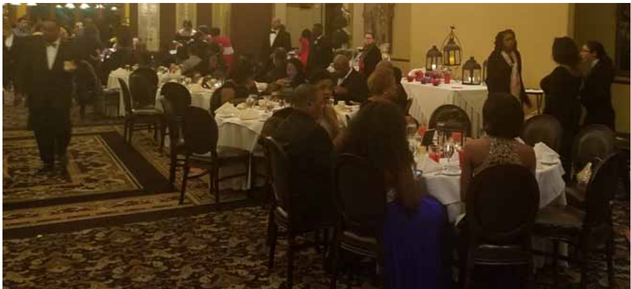
Alpha Mu Nu Patrons dining at the Que Delta Ball