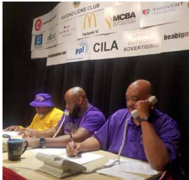
Alpha Mu Nu Brothers man the phones at the telethon

Stroudsburg, PA. November 5, 2017. The Brothers of Alpha Mu Nu participated in its annual telethon from 12 noon to 8:00 p.m. It was televised live from the studios of East Stroudsburg University on its local channel 13. Big Brothers Big Sisters of the Bridge have been serving Monroe County since its inception in 1974. They have strived to provide high quality mentoring services to the children and families of Northeastern Pennsylvania. Brothers answer and made calls to previous donors along with other local service organizations and administrators of local school districts. This year the organization was able to raise $30,000. Omega Psi Phi and Big Brother Big Sister has had an outstanding relationship for many years and this telethon is continuation of service and uplift in the Pocono/Lehigh Valley region.