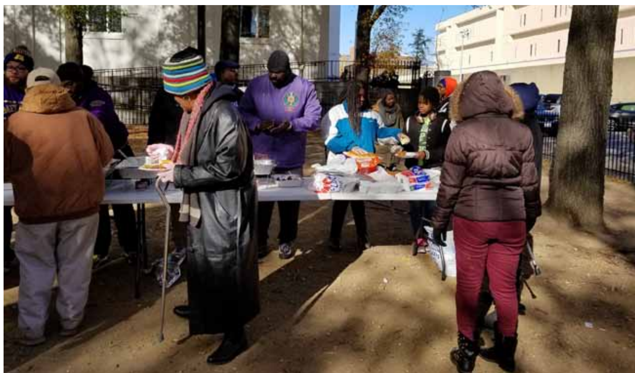
Brothers and volunteers feeding the Homeless

All four events took place at St. Vincent de Paul Church Park which is located 120 North Front Street, Baltimore Maryland 21202