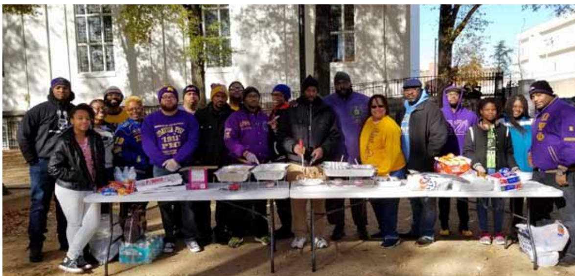
Brothers working tirelessly to feed and cloth the Homeless on every holiday

Baltimore, MD. November 12, 2017. On November 11, 2017, Brothers from Pi Omega participated in the Veteran's Day Feeding. The brothers prepared scrambled eggs and turkey sausage to feed over 100 people in the homeless community. The Brothers also received croissants, fresh fruit and 100 pieces of fried chicken from other organizations to go along with the meal. The Brothers provided bottle water, chips, 50 toothbrushes and toothpaste.