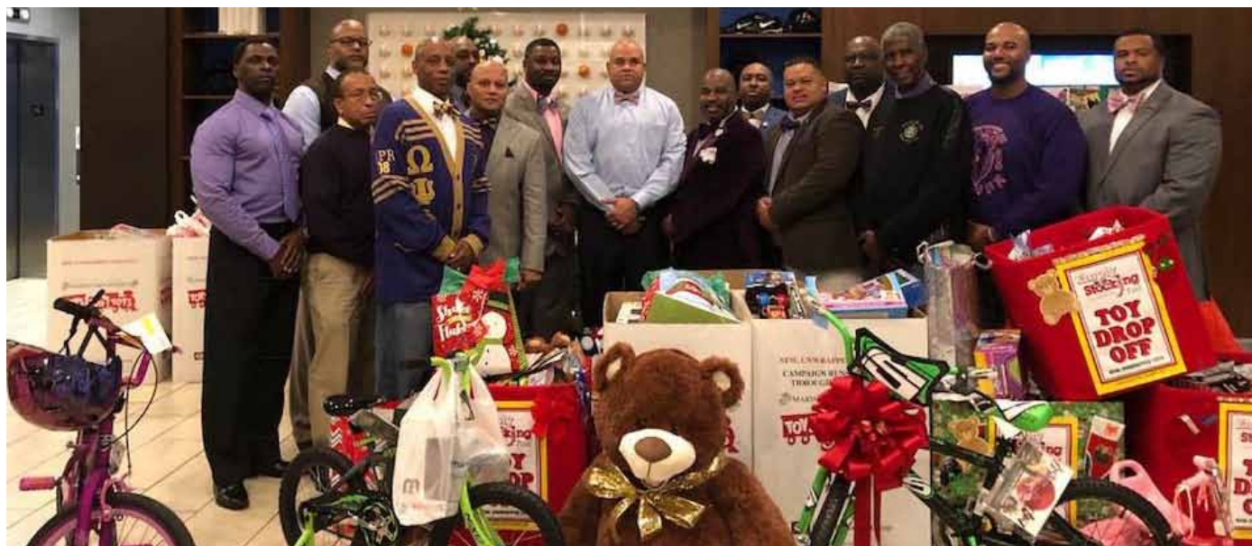
Brothers of Iota Nu gathered around the donated toys before donating them to Toys for Tots and the Empty Stocking Fund.

Aberdeen, MD. December 8, 2017. Iota Nu Chapter continued to spread holiday spirit by conducting their annual Bow Tie Holiday Social Toy Drive. The brothers of Iota Nu partnered with the Chesapeake Lodge #48 Masons of Harford County to gather toys for children for the upcoming holiday. The event was held at the Courtyard Marriott. Patrons and