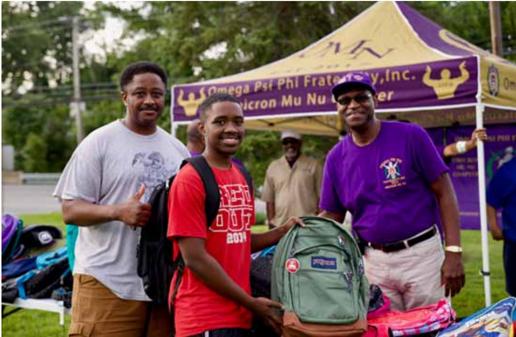
Omicron Mu Nu Brothers giving school back packs to kids