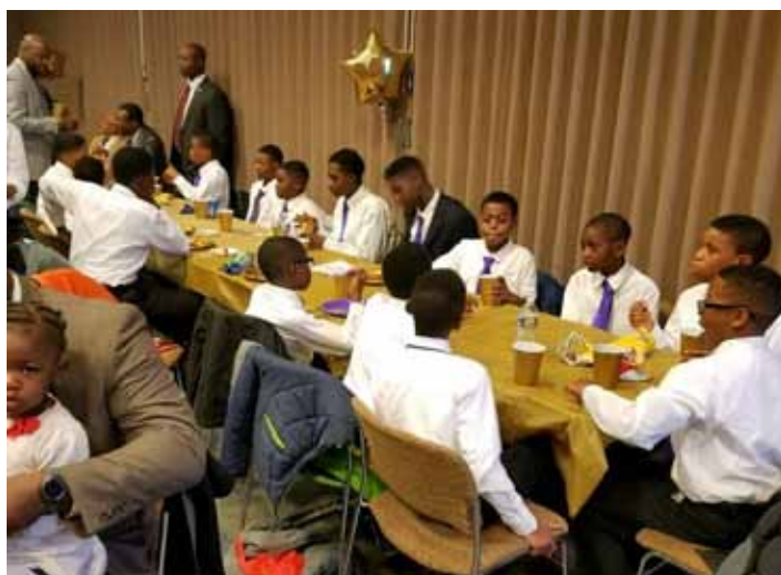
Tau Pi Mentees at the Founders Day Brunch

Tau Pi's Mentoring Initiative consists of 28 mentees and 25 mentors. It has been in Partnership with Howard County Public Schools since its inception in 1994.