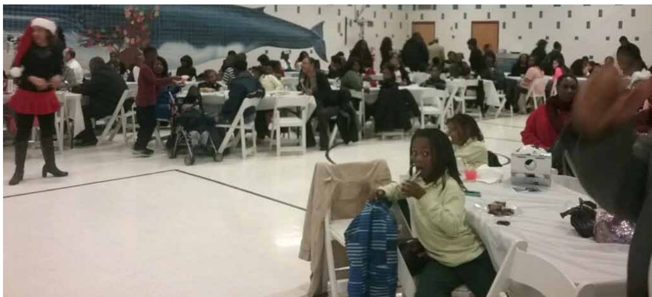
Patrons attending the Toy Giveaway Christmas Party at Suitland Elementary School

Suitland, MD. December 5, 2017. Brothers from The Super Chapter were quite busy bringing holiday cheer to communities in need during the recent Thanksgiving and now Christmas season. Led by the hard-charging Social Action Committee, a team of Brothers helped put the Christmas gleam in the eyes of a large group of young kids in the Suitland community by leading a Toy Giveaway Christmas Party at Suitland Elementary School on Tuesday evening, December 5. Along with Friendship Charities Foundation (FCFI) and the Lambda Gamma Gamma Chapter of Omega Psi Phi Fraternity, Inc, Gamma Pi Brothers and the other Omega men purchased toys for 90 boys and girls ages 3-12.