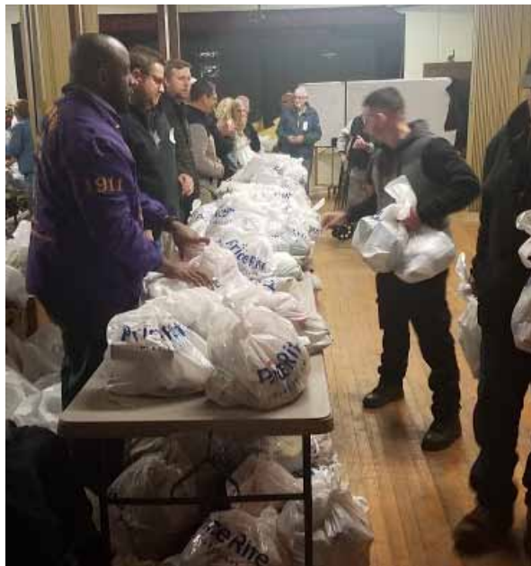
Alpha Mu Nu Brothers assisting with Thanksgiving Outreach

Allentown, PA. November 21, 2017. Alpha Mu Nu chapter assisted with the City Limits Assembly of God Church's Thanksgiving Outreach. Every Tuesday during the week of Thanksgiving, this event consists of donating over 350 turkeys and groceries to the local community in Allentown, Bethlehem, and Easton. For over 20 years, this event was a success and brothers of Alpha Mu Nu were fortunate enough to assist the church for the 1st time. The church says it is dedicated to reaching out and meeting the material and spiritual needs of the community. This was an amazing for Omega to sustain a presence as we continue to serve and give back to our community.