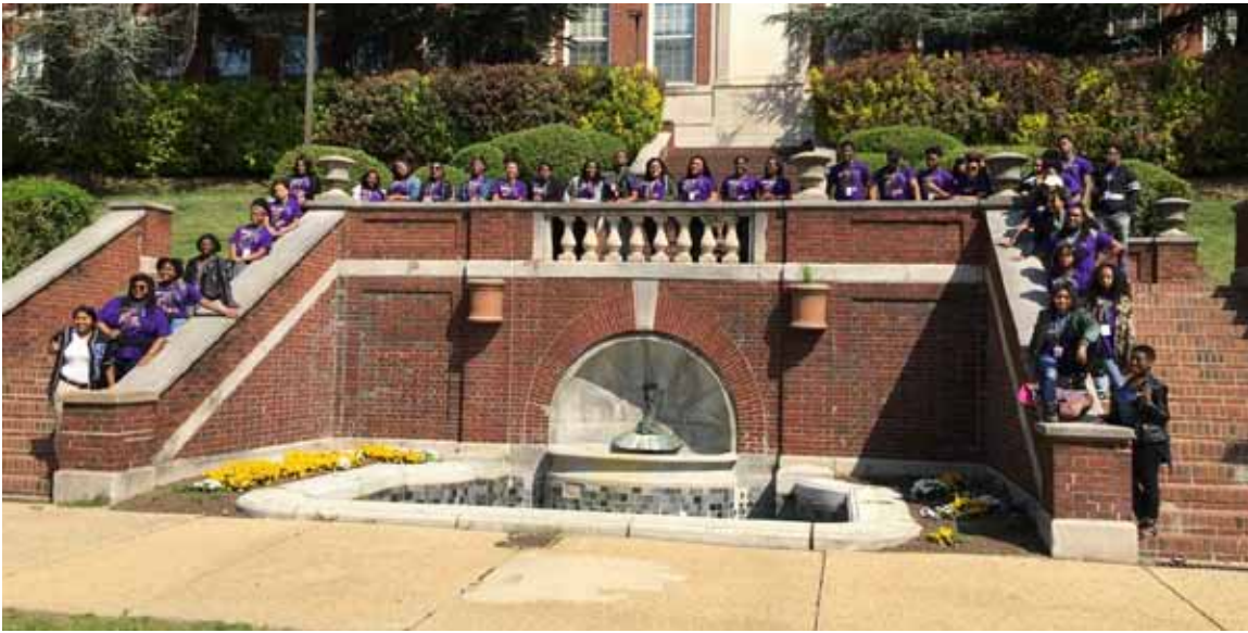
Iota Phi HBCU Tour Students at Norfolk State University

Pittsburgh, PA. April 8 – 15, 2017. Iota Phi took 64 students to 14 HBCU colleges/universities on its 20th consecutive Historical Black College Tour April 8 – 15, 2017. During the tour, students also visit historical sites and museums. This is one of the longest consecutive HBCU tours in the country.