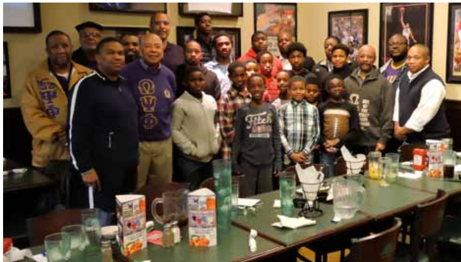
Tau Pi Brothers with Mentees at Christmas Party at the Green Turtle Restaurant

Columbia, MD. December 23, 2017. To ensure well rounded mentee social and tradition development, Tau Pi Mentee Initiative conducted its traditional Mentee Christmas Celebration for its mentees.