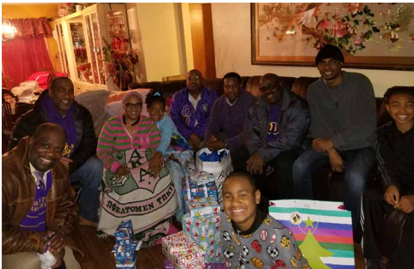
Gamma Mu Nu and Psi Zeta Chapter Brothers with Gifts for Family