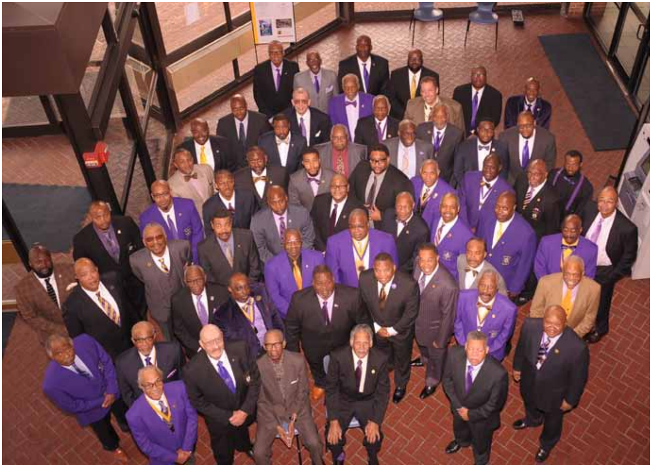
Pi Omega Brothers in attendance at the Achievement Week program at Coppin State University