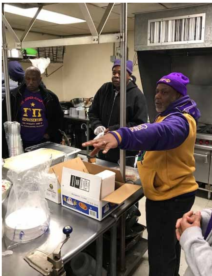
Gamma Pi Brothers preprepare food for the MLK Day of Service Luncheon