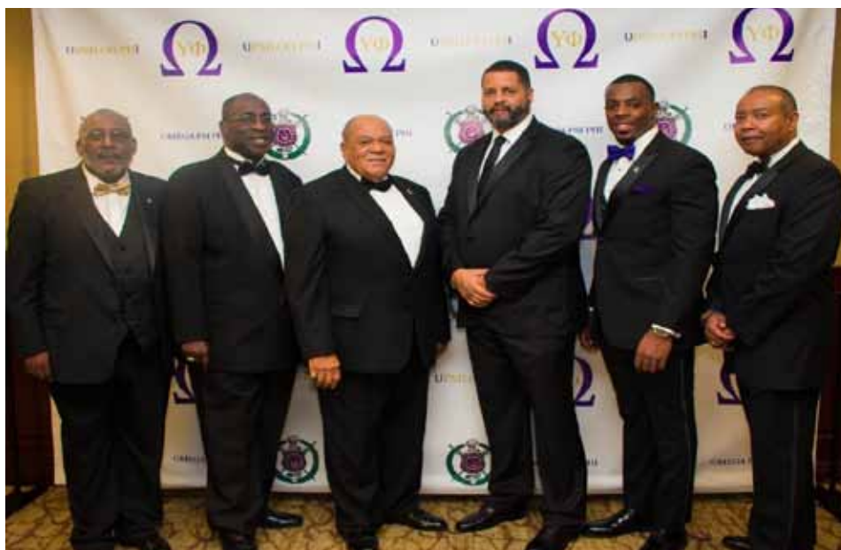
Upsilon Phi Brothers at the 90th Anniversary Dinner Dance

Newark, NJ. October 28, 2017. Upsilon Phi Chapter, the Mother Pearl of New Jersey, celebrated its 90th anniversary on October 28, 2017. The Chapter was chartered on October 22, 1927 in Newark, New Jersey and has provided invaluable leadership and service to the greater Newark community and Essex County in New Jersey. Upsilon Phi was the first chapter in New Jersey.