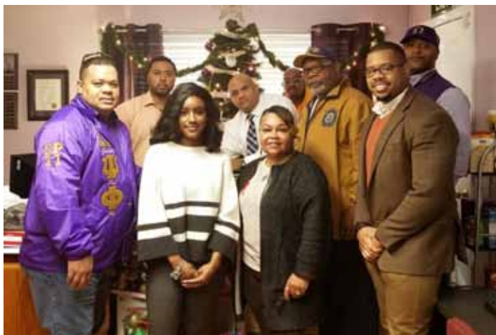
Iota Nu Brothers with Harford Family House directors and organizers.

Aberdeen, MD. December 1, 2017. Iota Nu Chapter transitioned from Achievement Week and Thanksgiving and immediately transitioned in the Christmas holiday. The Brothers of Iota Nu partnered with the Harford Family House to Adopt two families that otherwise would not have been able to celebrate the upcoming holiday. The families provided the Iota Nu Chapter their list and the Brothers granted these families their wishes. The Brothers also bought Christmas decorations so that the families were able to decorate their homes. Gifts included clothes, toys, and kitchen appliances.