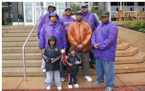
Pi Omega Members participating in the Heart Walk

half way to reaching its goal as it is still collecting donations from sponsors. Donations have been made from brothers of Omega, family members, friends, and co-workers. The representative team, "The Charm City Ques", was a team of 9, that consisted of 6 brothers from Pi Omega, the wife of an Omega, and the two young sons of an Omega. The Pi Omega Social Action committee would like to thank the participants of this event as well as the sponsors that gave donations.