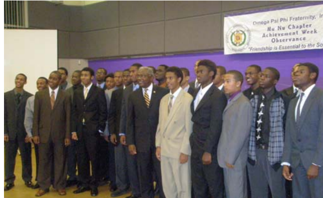
Bro. Clyburn, U.S. Congressman, poses for photo with student awardees.

This year's featured speaker was Bro. Congressman James E. Clyburn, U.S. House of Representatives (Xi Psi, South Carolina State University) who shared words of wisdom, praise for the students and their parents, and some fitting anecdotes and reflections. The Business Person