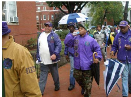
Brothers of the 2nd & 3rd District Participate in the ADA Walk in Washington D.C.

This year's walk started off as a cool and rainy morning, but the Brothers' enthusiasm was not