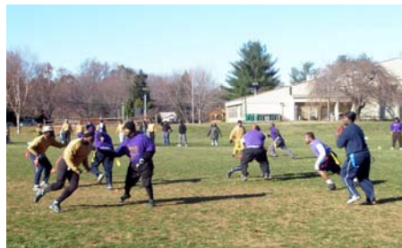
Mu Nu & Gamma Pi Brothers playing the game

Mu Nu wore old gold and displayed considerable talent as its offense rolled throughout the day and its defense stepped up mightily. Gamma Pi did its best to counter in their royal purple attire with occasional sparks of offensive prowess and defensive tenacity.