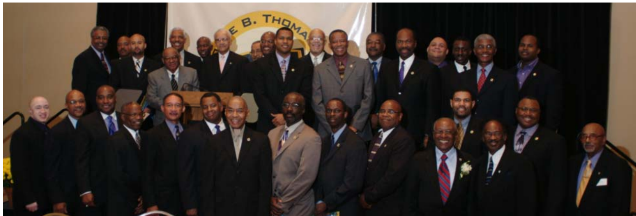
Mu Nu Chapter poses at the GBTLA Anniversary Gala